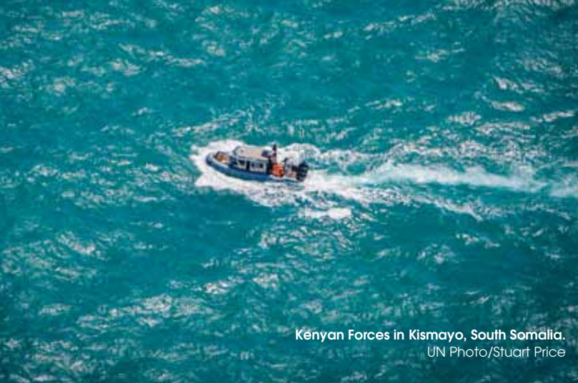
Kenyan Forces in Kismayo, South Somalia.

support from UNODC and the EU. The training focused on several important issues such as communication, ethics, remand prisoners, vulnerable groups (in particular juveniles), as well as practical issues such as cell and inmate searches. Prison staff also had the opportunity to tour the new wing of the Seychelles Montaigne Posse Prison built for suspected piracy prisoners. The new wing includes 60 beds and was built with funding and design assistance from UNODC.