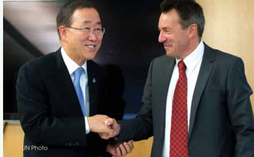
Above: Secretary-General Ban Ki-moon ( left ) with Peter Maurer, President, International Committee of the Red Cross ( ICRC ).

Deputy Permanent Observer & Legal Adviser International Committee of the Red Cross