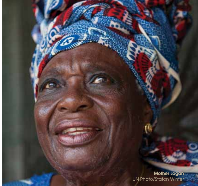
Mother Logan

Today, Liberia is a transitional environment where ICRC detention work aims primarily at improving conditions of detention in close partnership with the Bureau of Corrections and Rehabilitation (BCR). A major focus is on capacity building and structural support to individual prisons, as well as to the penitentiary system