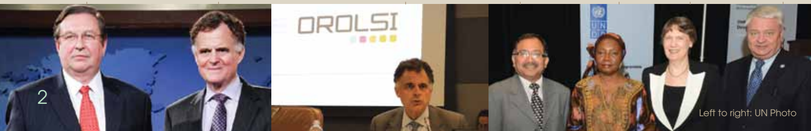
Hervé Ladsous USG, DPKO